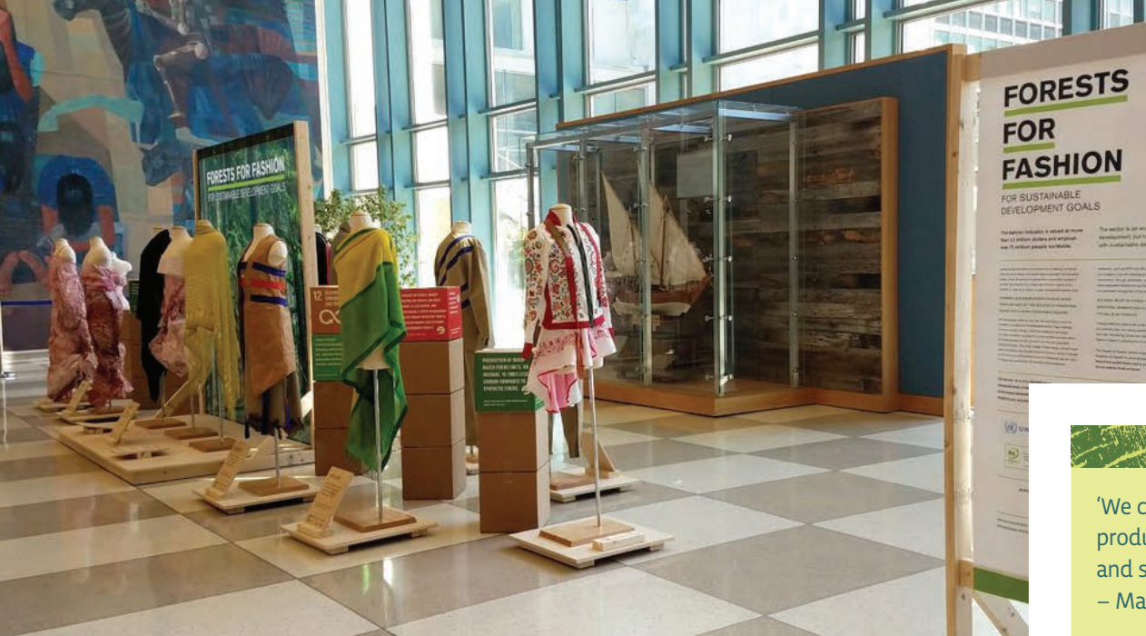
Forests for fashion in New York... many designers inspired to use forest-derived materials for their creations.